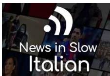
News Podcast Beginner, Intermediate and Advanced