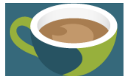
Coffee Break Italian

Online Magazine (digital and print subscriptions available)